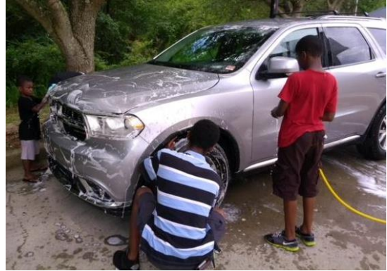
In the Photo: Youth and young adults washing a vehicle at the fund raising event.