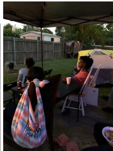
In the Photos: Christ the Redeemer saints at movie night.