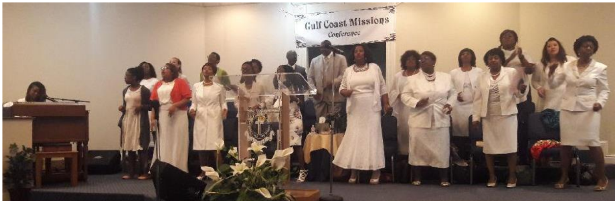
In the photo: The Gulf Coast Jurisdiction Missions choir singing on Sunday morning at the conference.

Annual Missions Conference filled with seminars, canvassing and preaching