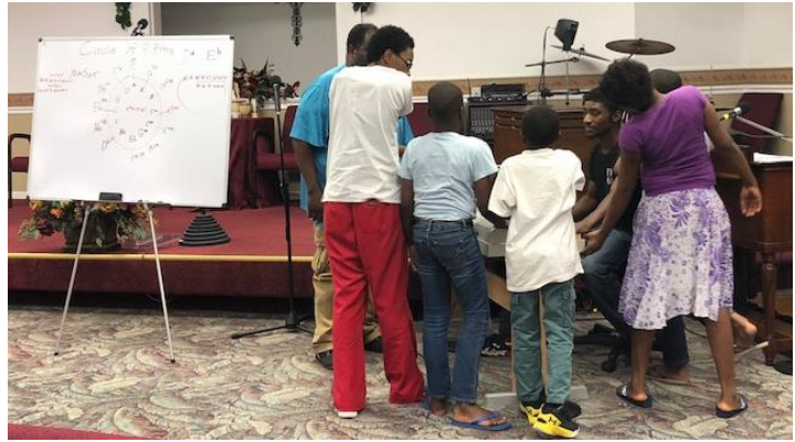
In the Photos: Christ the Redeemer saints in music class.