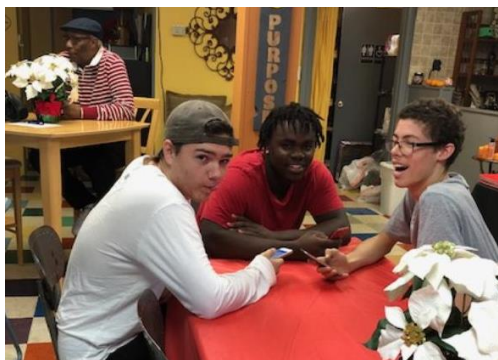
In the Photos: Holy of Holies Tabernacle and the Carrollwood Bible Study Center saints enjoying a Christmas party.