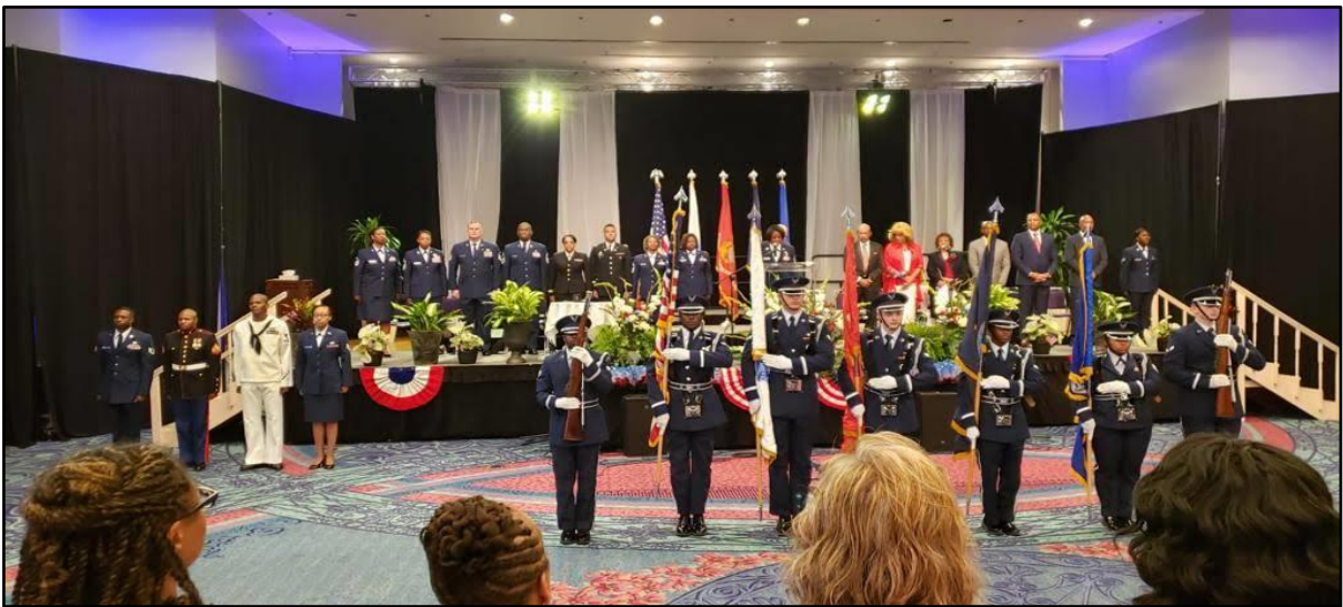
In the Photo: Saints participating in the military tribute on July 4 at the 2019 General Assembly.

MOBILE, ALA. – The Word of God encouraged the saints in churches and Bible studies from around the world to endure afflictions, fight the good fight of faith and dig another well at The Church of the Living God International, Inc.’s annual General Assembly.