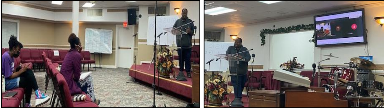
In the photos: Participants in the music and voice classes held at Christ the Redeemer Church in Gulfport, Miss.