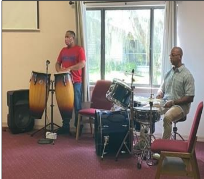
In the Photos: Saints enjoying the revival retreat hosted by Holy of Holies Tabernacle.