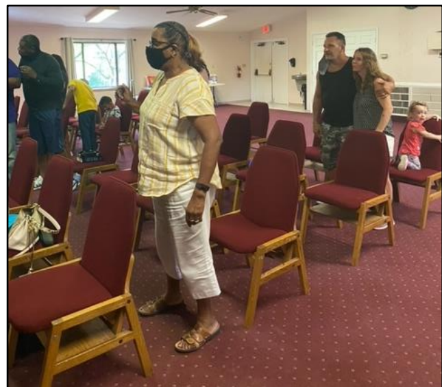
In the Photos: Saints enjoying the revival retreat.

We ended the night with a campfire and games. It was so much fun to see the young and old melting marshmallows over the crackling campfire and eating s’mores. We headed back to camp and the competition was on with Connect Four, giant Jenga and Uno. We enjoyed snacks, talking, laughing and sitting in the rocking chairs on the porch.