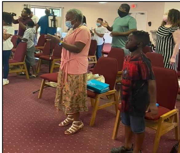
In the Photos: Saints enjoying the revival retreat hosted by Holy of Holies Tabernacle.