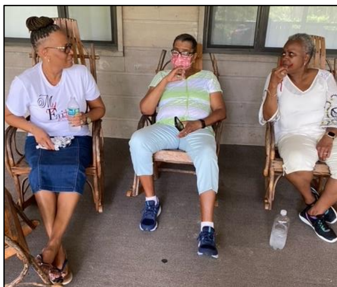
In the Photos: Saints enjoying the revival retreat hosted by Holy of Holies Tabernacle.