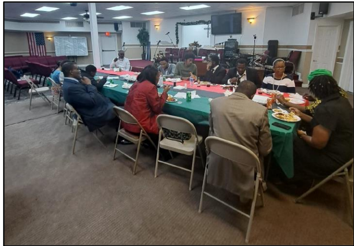
In the Photos: Christ the Redeemer saints enjoying Black History Month celebrations in Gulfport, Miss.