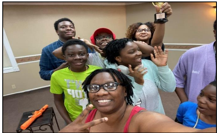
In the Photo: Christ the Redeemer's youth enjoying the church Lock in.