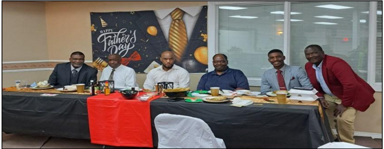
In the Photo: Christ the Redeemer's fathers celebrating their special day, Father's Day in Gulfport, MS.