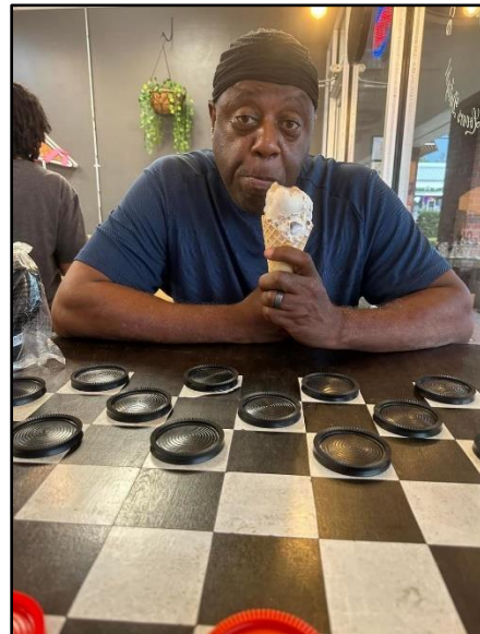
In the Photos: Holy of Holies Tabernacle fathers enjoying their Father's Day weekend celebrations.