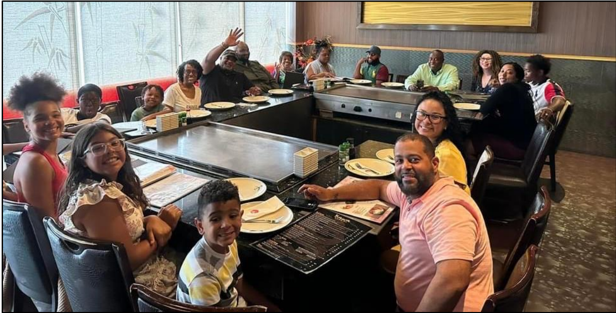
In the Photos: Holy of Holies Tabernacle fathers enjoying their Father's Day weekend celebrations.