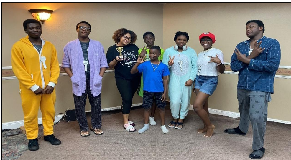
In the Photo: Christ the Redeemer's youth enjoying the church Lock In.