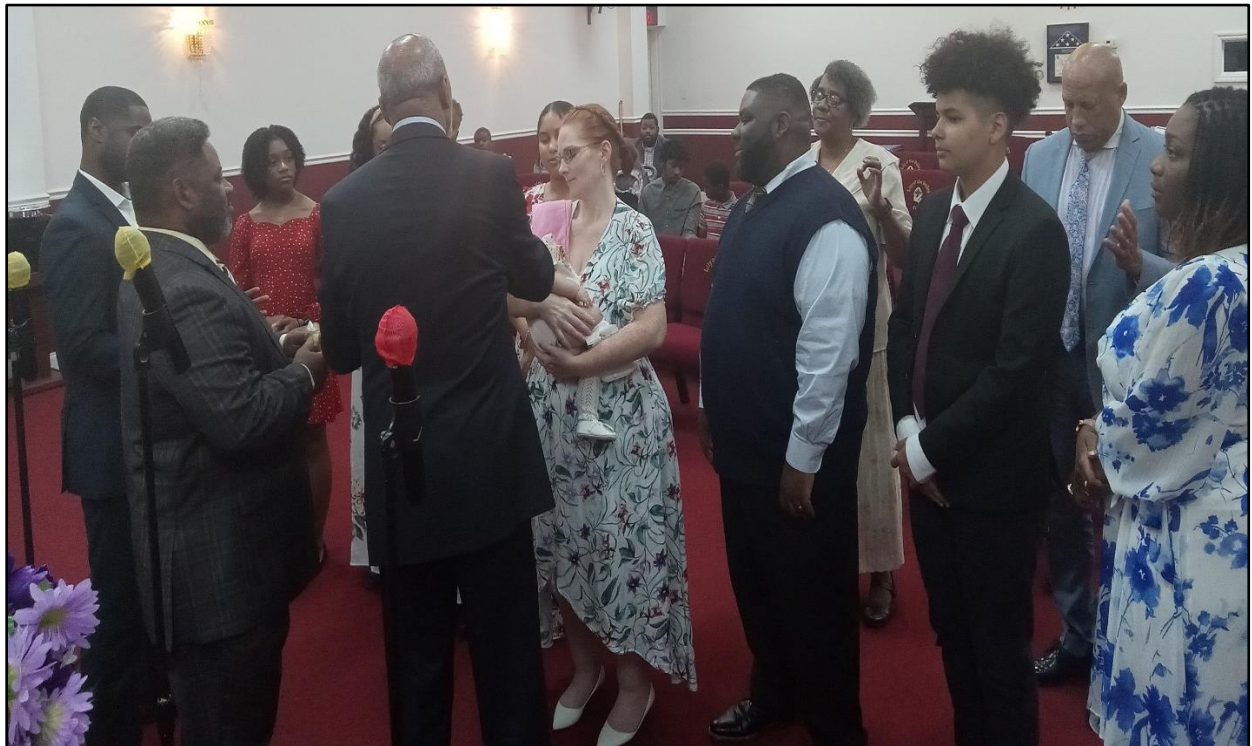
In the Photos: Saints enjoying the baby dedication at Lily of the Valley Church in Thonotosassa, FL.