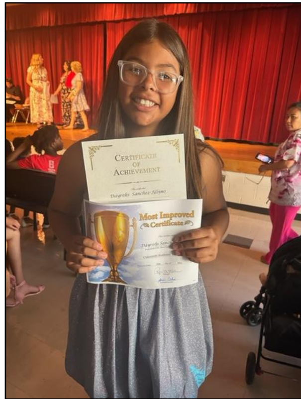
In the Photos: Holy of Holies Tabernacle celebrates its school graduates.