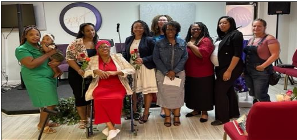
In the Photos: Saints honoring their mothers on Mother's Day at Holy of Holies Tabernacle in Holiday, FL.