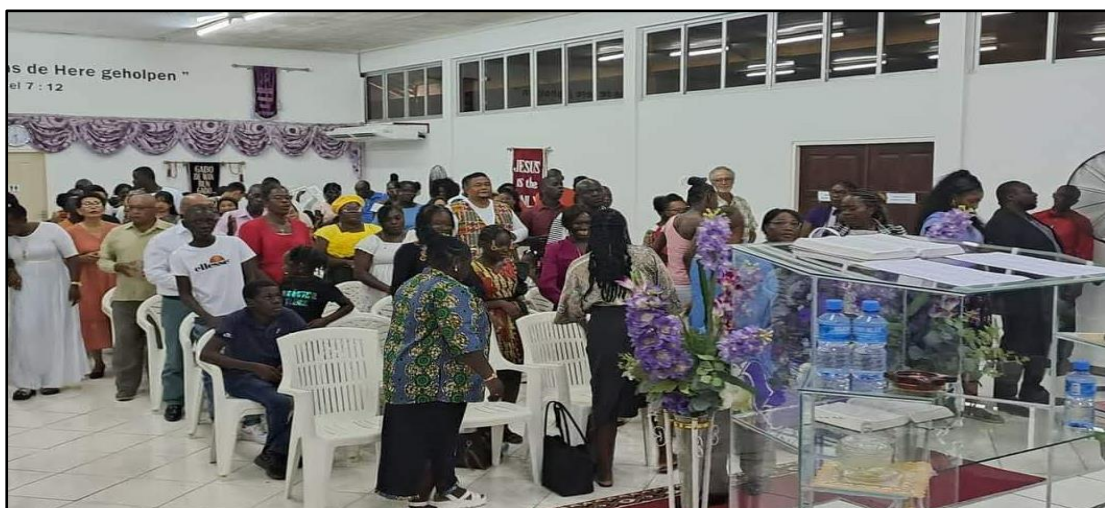
In the Photos: Saints enjoying themselves at the South American Jurisdictional Conference.