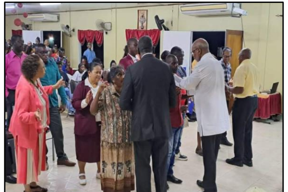
In the Photos: Saints enjoying themselves at the South American Jurisdictional Conference.