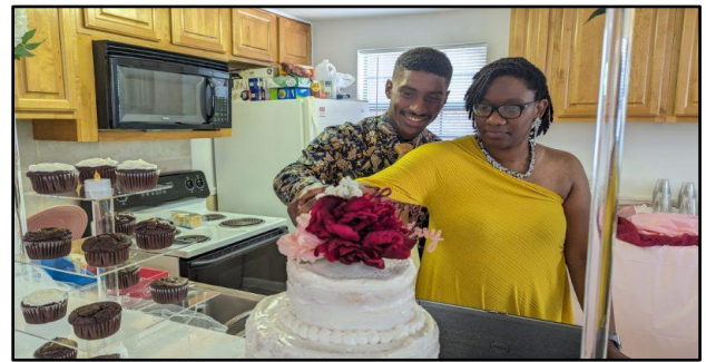
In the Photos: Christ the Redeemer’s couples enjoying their wedding anniversary celebration in Gulfport, Miss.